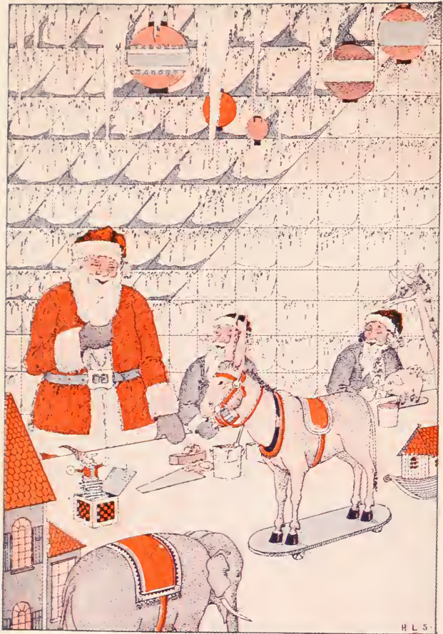
The Nodding Donkey's First Appearance. Frontispiece—(Page 2)